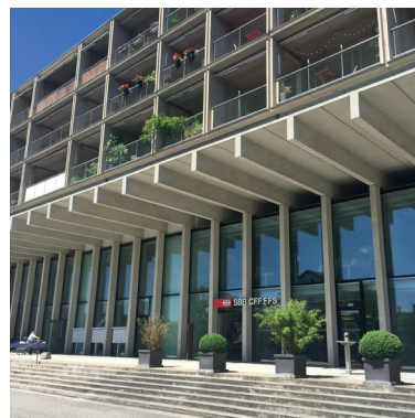
SBB-Wylerpark

The seminar was a great success, with many SBB employees attending - not just from the legal department, but also from claims handling, fares, and marketing.