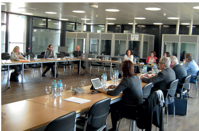
Data protection, PRR, ticketing: a very full agenda for the CIV Working Group

For now, it is anticipated that these modifications will be approved in writing by the CIV Committee in March/April 2018, so that the revised MIRT can come into force at the same time as the UIC leaflets.