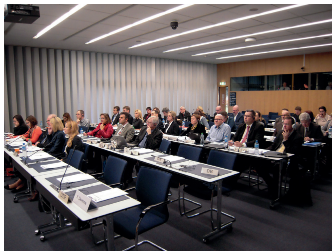
The members of the General Assembly took note of the status of the work in the different areas of CIT

cesare.brand(at)cit-rail.org Original: DE