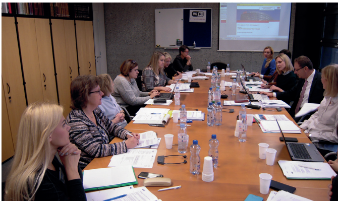
The CIM working group decides important proposals for the freight transport

Cross-border rail freight is increasingly taking the form of sub-contracted carriage as per Article 27 CIM, or under the "purchase/sale" model. However, the latest information available to the CIT GS indicates that many railways, especially in central and eastern Europe, continue to use the successive carriage model as per Article 26 CIM. The CIT survey and the CIT GS's legal analysis concluded that the "purchase/sale" model is legally nothing new, and thus requires no new CIT products to be developed.