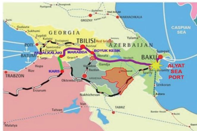
Big plans afoot for the Baku-Tbilisi-Kars-Line

Furthermore, the deep-sea port in Anaklia (Georgia) currently under construction represents another new multimodal connection between the Caspian and Black Sea areas.