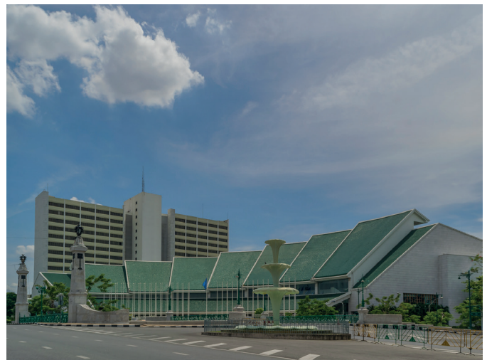
The meeting of intermodal rail transport in Northeast Asia and Central Asia was held at the ESCAP secretariat in Bangkok