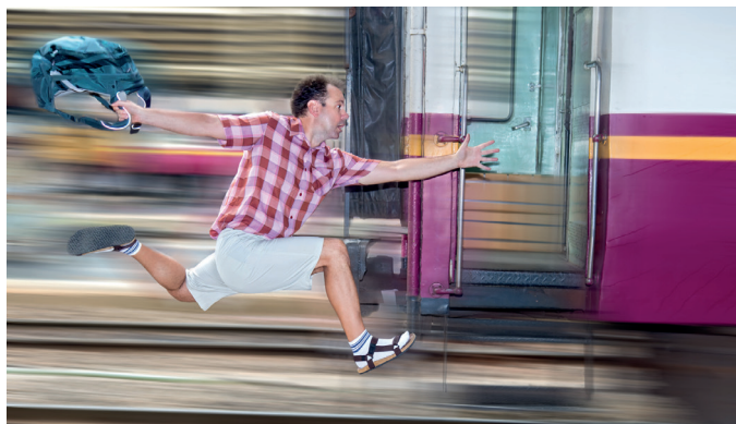
This draft brings to the fore the protection of passengers and their rights

Following an initial draft report by the TRAN Committee Rapporteur which looked positive, things took a turn for the worse for railway undertakings with the publication of the TRAN Committee’s amendments in October 2018.