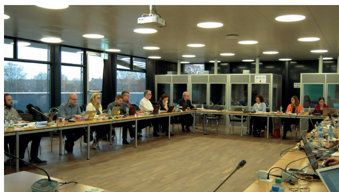
Ticketing and digitalisation: new technologies raise a host of legal questions

The CIV Working Group will thus closely monitor the rail projects seeking to apply these new technologies in order to deal with the fundamental issues they throw up and adapt, where necessary, the CIT products relating to ticketing and after-sales services.