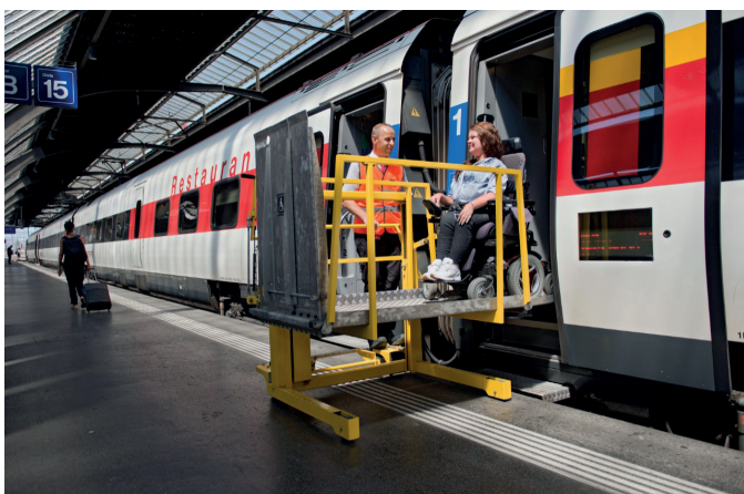
Assistance provided in the station by the railway's staff

The amended draft still has to be approved by the European Parliament in plenary session, which is not set to happen before December 2018/early 2019. It is not yet possible to say when the Council might vote on it.