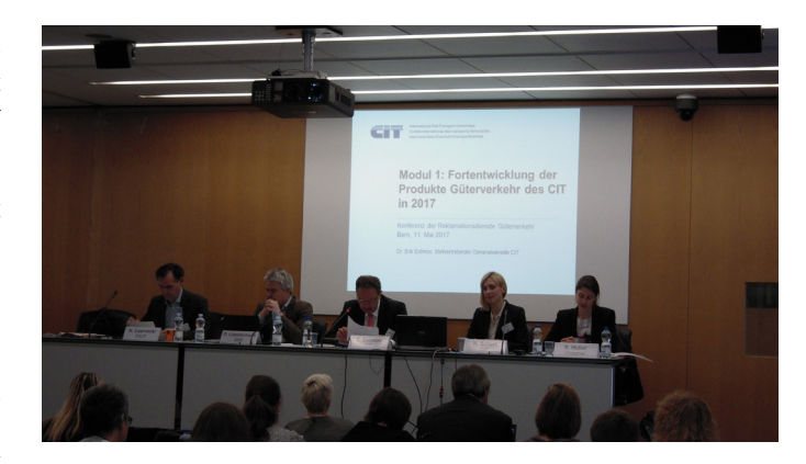
In the first module current subjects were discussed

At the end of the conference, a rapporteur for each group presented the results of their discussions in the plenary session. The ideas proposed by the work groups for solving the issues will be examined this year by the CIM Working Group of the CIT.