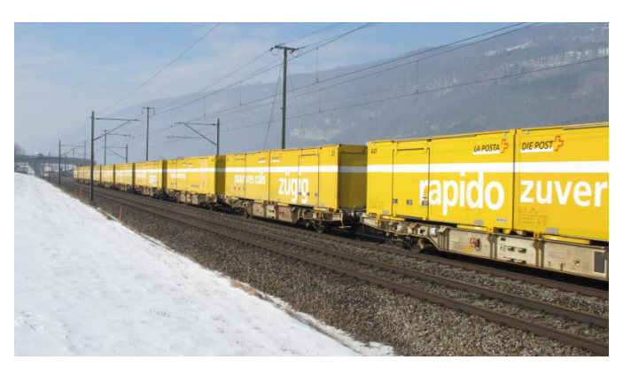
Swiss postal items by rail

Some 90% of freight shipments between China and Europe today are transported by sea, with each shipment taking approximately 40 days to complete the journey. Around 9% of the shipments are transported by airfreight and are delivered within a day. Rail freight currently has a market share of just under 1% in terms of total volume. Consignments between Hamburg and Zhengzhou in China, for example, take 15 days and are thus a viable alternative to sea freight (in terms of time) and airfreight (in terms of price). The Peoples' Republic of China is the most important country of origin for the import of goods into the EU and is now developing into one of its most rapidly growing export markets. The daily volume of trade between China and Europe is way above 1 billion euros in value, which means there is huge potential for the carriage of postal items by rail in both directions. According to information provided by the Coordinating Council on Trans-Siberian Transportation (CCTT), the volume of consignments transported in 2013 between the People's Republic of China and the Russian Federation amounted to 64,000 tonnes, which is equivalent to approximately 8,000 containers. On the basis of these figures, an annual growth of 10 to 15% was forecast, indicating that a volume of some 400,000 containers in rail transit shipments from China to Europe can be expected in the medium term.