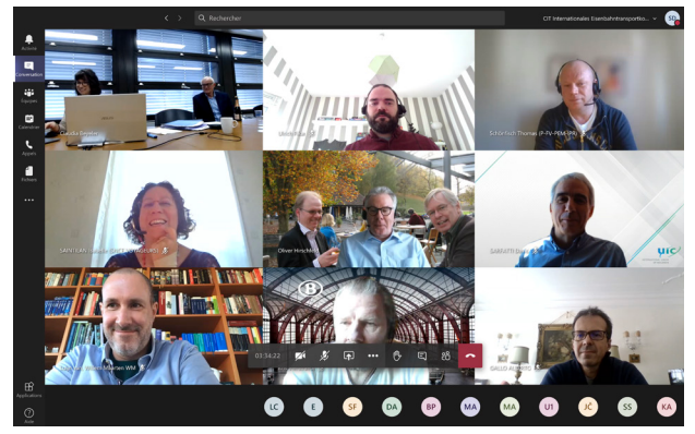
The 50th CIV Working Group in celebratory mood