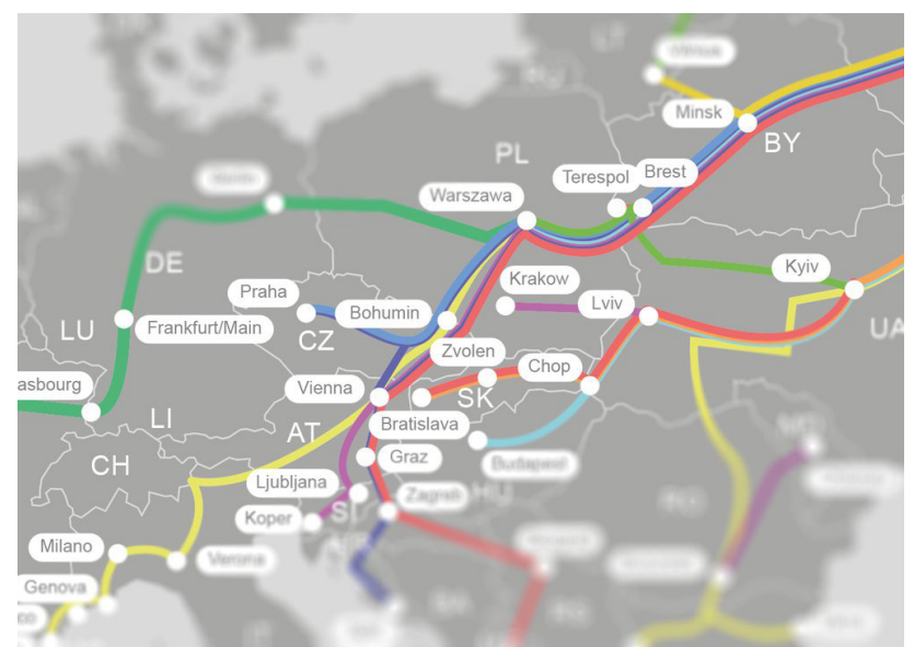
Railway connections in the International East-West Passenger Traffic