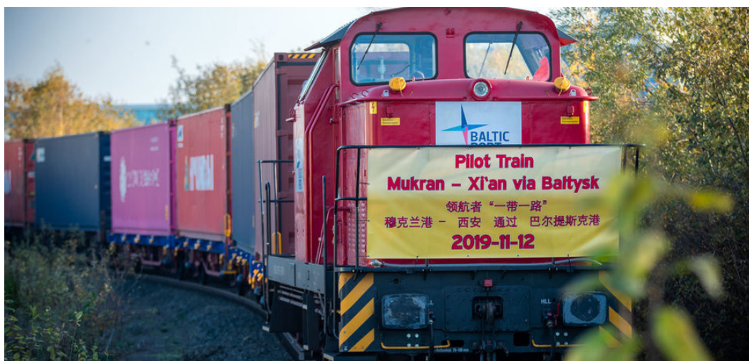
The first Chinese train on the «New Silk Road» reaches the port of Mukran (12.11.2019)