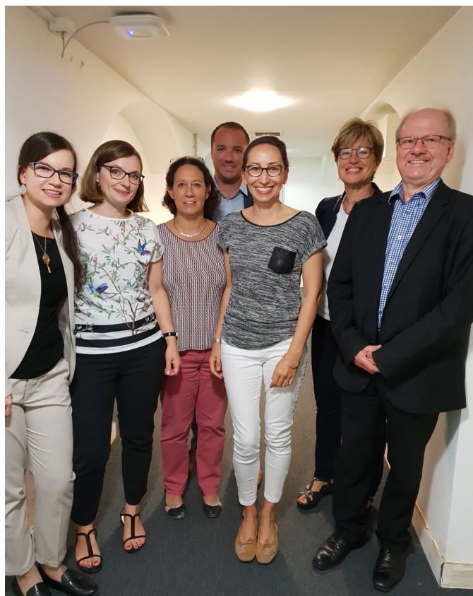
A warm welcome from the General Counsel and her colleagues from SNCF Mobilités in Paris