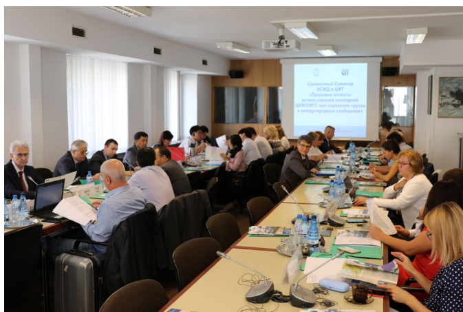
More than 50 experts took part in the seminar in Warsaw

The new rail freight services from China to Europe showed an unexpectedly sharp increase in the first half of 2018, and recently to Italy, with a new service organised and operated by the Rail Cargo Group (RCG) in partnership with the China Railway Container Transportation Corp. Ltd (CRCT). As a result of this rapidly increasing volume of traffic, the question of congestion at the Malaszewicze border crossing on the Belarusian-Polish border has been raised and the strain on the current modernisation and expansion of the border terminal.