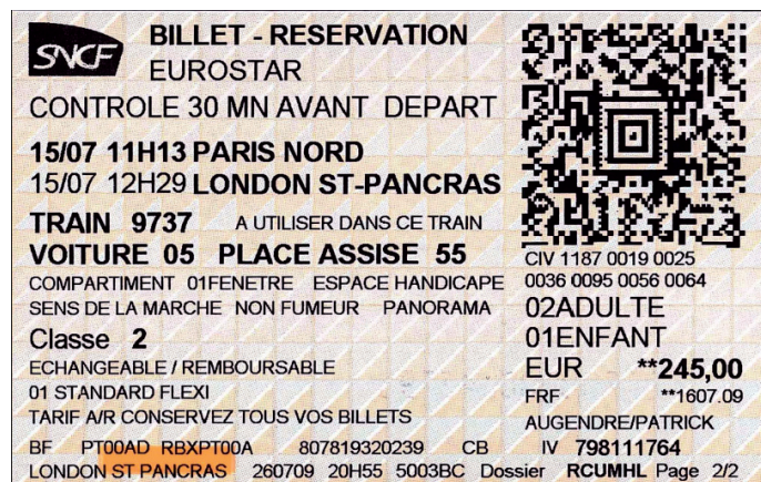
Prototype of a ticket using the credit card format

The "orange bar" optical security feature on the RCT2 coupon is not appropriate for the credit card format. A new security element which will be instantly recognisable to ticket examination staff is needed. SBB is about to carry out field trials using domestic paper stock. If these tests are successful, SBB's approach could help the CIT to develop a cost-effective security standard.