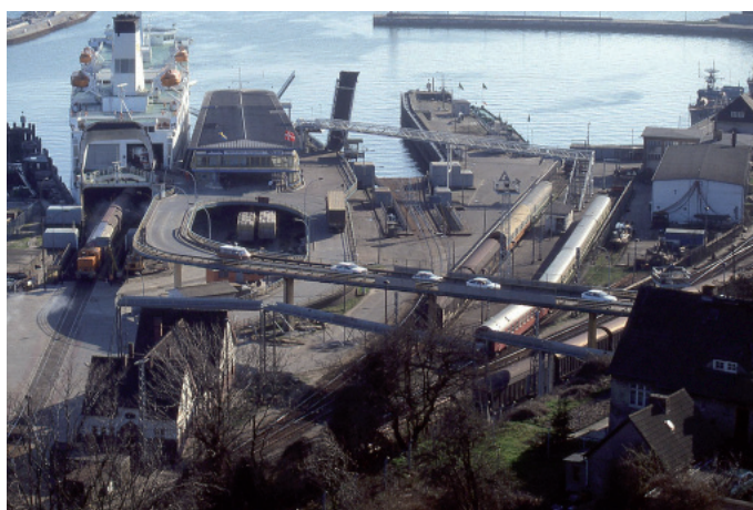
The Ferry Port in Sassnitz

Erik.Evtimov(at)cit-rail.org Original: DE