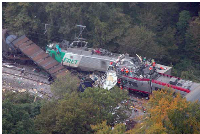
Liability between infrastructure managers and railway undertakings urgently requires standardised international rules (Accident near Zoufftgen of 11 October 2006).

It cannot be contested that the application of the CUI to domestic traffic as well is desirable. Nor is there any reason why it should not be extended, at least for the case of domestic carriage being