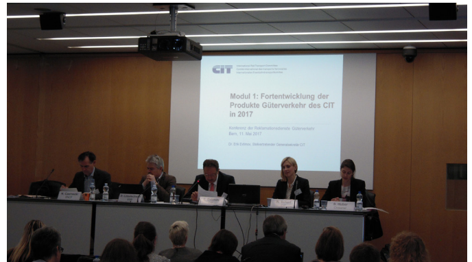
In the first module current subjects were discussed

At the end of the conference, a rapporteur for each group presented the results of their discussions in the plenary session. The ideas proposed by the work groups for solving the issues will be examined this year by the CIM Working Group of the CIT.