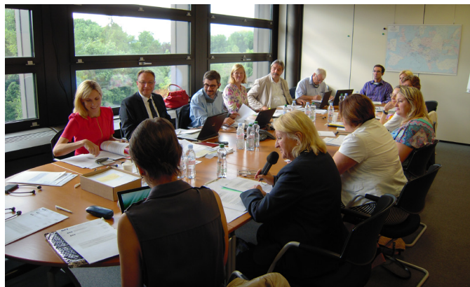
Electronic consignment note - one of the focuses of the working group

erik.evtimov(at)cit-rail.org Original: DE