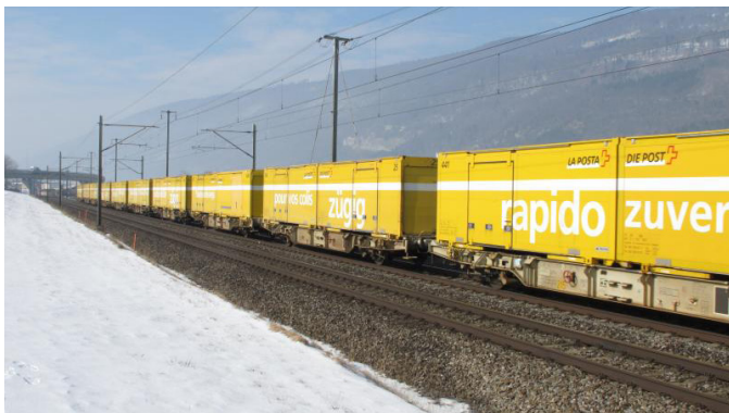
Swiss postal items by rail

Some 90% of freight shipments between China and Europe today are transported by sea, with each shipment taking approximately 40 days to complete the journey. Around 9% of the shipments are transported by airfreight and are delivered within a day. Rail freight currently has a market share of just under 1% in terms of total volume. Consignments between Hamburg and Zhengzhou in China, for example, take 15 days and are thus a viable alternative to sea freight (in terms of time) and airfreight (in terms of price). The Peoples' Republic of China is the most important country of origin for the import of goods into the EU and is now developing into one of its most rapidly growing export markets. The daily volume of trade between China and Europe is way above 1 billion euros in value, which means there is huge potential for the carriage of postal items by rail in both directions. According to information provided by the Coordinating Council on Trans-Siberian Transportation (CCTT), the volume of consignments transported in 2013 between the People's Republic of China and the Russian Federation amounted to 64,000 tonnes, which is equivalent to approximately 8,000 containers. On the basis of these figures, an annual growth of 10 to 15% was forecast, indicating that a volume of some 400,000 containers in rail transit shipments from China to Europe can be expected in the medium term.