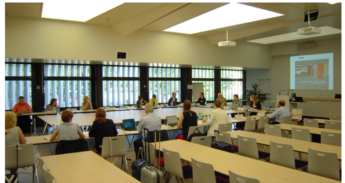
Implications of the GDPR discussed by representatives of DB, ČD, SNCF, SNCB, Eurostar, Trenitalia, NS, LG, ÖBB, SŽ, LDZ, CP, Renfe, SBB, VöV, Regiotrans, MAV START, Thalys and UZ

tetyana.payosova(at)cit-rail.org Original : EN