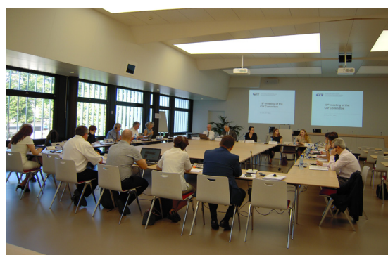
Data protection, PRR, multimodality, ticketing: a very full agenda for the 19th CIV Committee

The CIV Committee has adopted the comparative table presenting the different international conventions (COTIF/CIV and Montreal Convention) as well as the European regulations applicable to air and rail contracts of carriage. This new tool will be useful to the legal challenges for the establishment of combined air/rail products. It will be available from 1 September 2017 on the CIT website. The CIT is also making available to its members a table comparing the passenger rights in the four modes of transport.