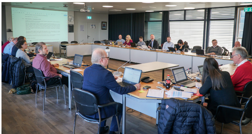
The CIV WG's works already set on 2020