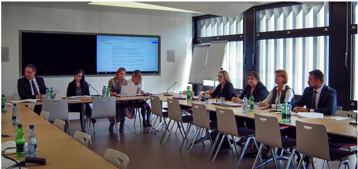
CIV/SMPS working group