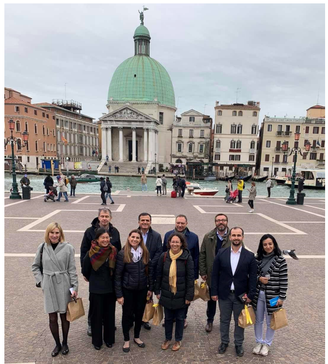
Some of the seminar participants after a visit to the Santa Lucia railway station. The railway station itself is behind the photographer.