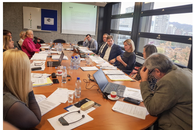
Members of the CIM Working Group can look back on a successful 2019.