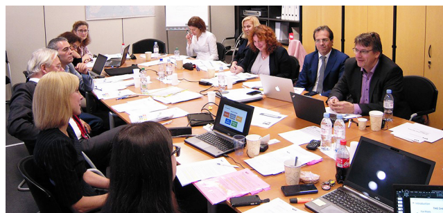
Members of the CUI Committee faced some tricky legal questions at the meeting.